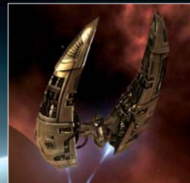
The Abaddon is the new Amarr Battleship

The ultra hi-res ships will be introduced next year, but they're not strictly a Kali feature