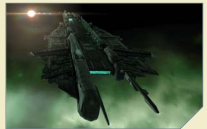
Looking for mercenary help? BDCI is a good starting point. They kill with style and attitude

Such is the respect gained that even victims, upon re-awakening in their clone chambers, have been left in awe. So much so that several clients have in fact been former targets