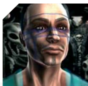
From top: Pythagoria, Trayk, and Zaphod Bee – BRUCE's three main Directors and also in charge of the sheep dip