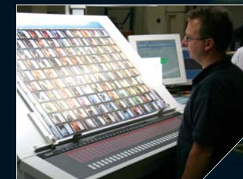
Cards on the table. EVE: The Second Genesis is already at the printing stage and is available to pre-order right now